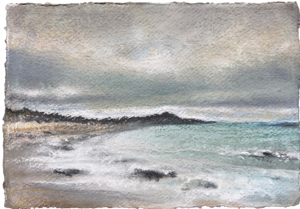
Killarney #3, 2024, dry pastel on rag paper, 15 x 21cm