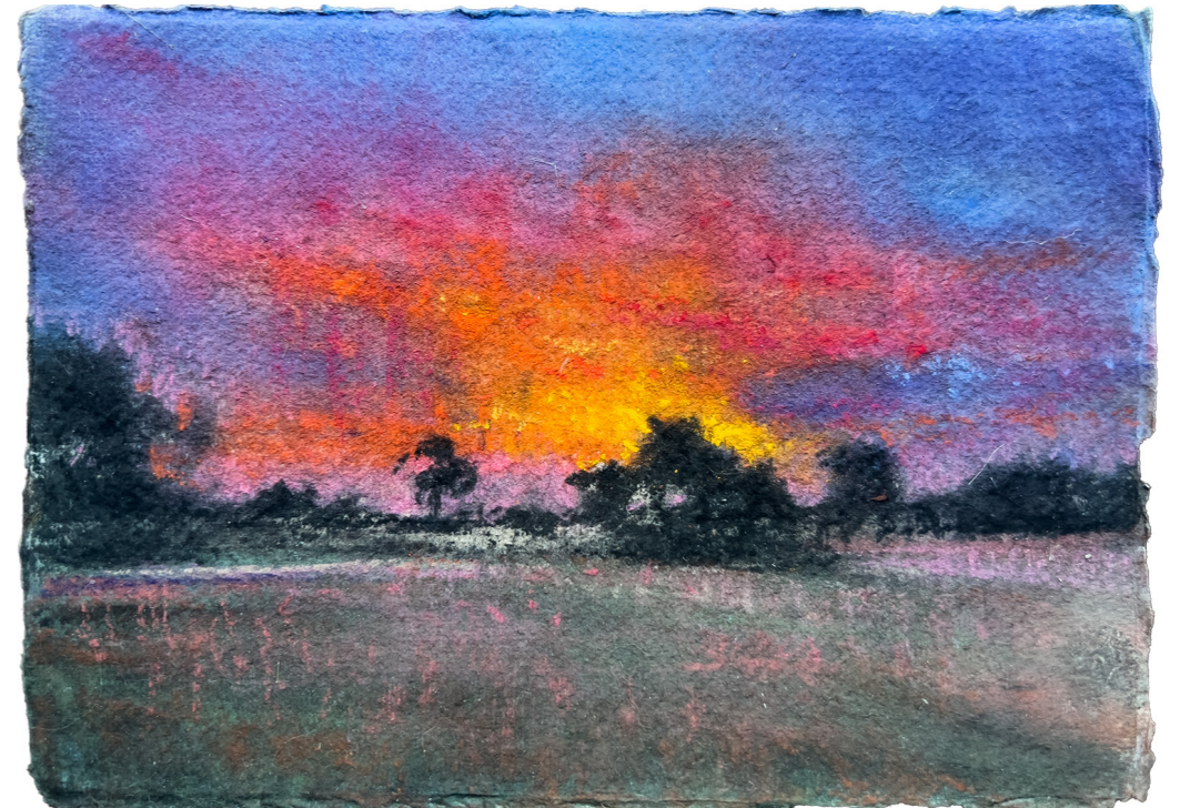
Tower Hill #5, 2024, dry pastel on rag paper, 15 x 21cm