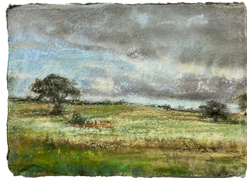
Towards Hamilton 2024, dry pastel on rag paper, 15 x 21cm