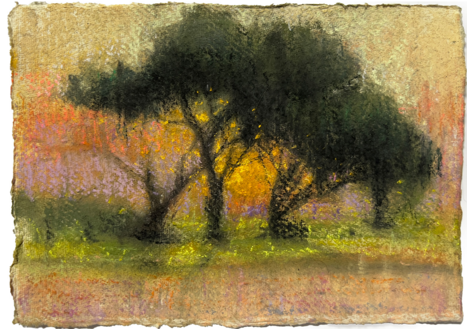
Tower Hill #2, 2024, dry pastel on rag paper, 15 x 21cm