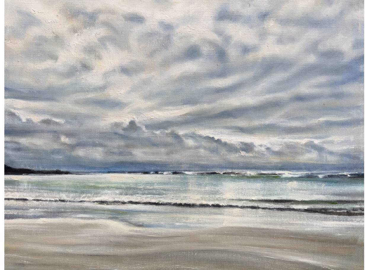
There is magic in walking alone, 2023 Oil on linen 35.5 x 45.5cm