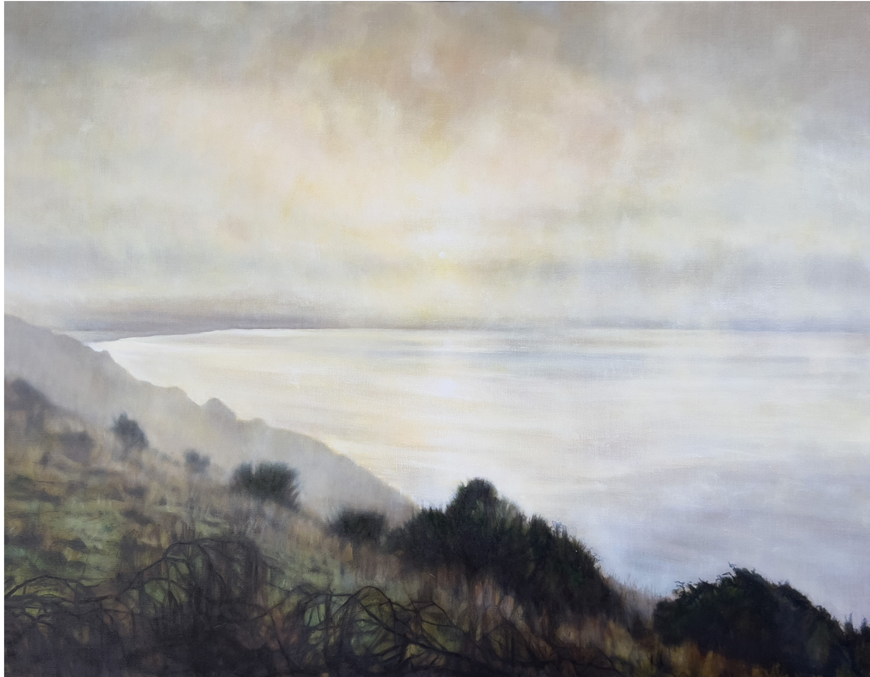
Recesses of Impenetrable feeling, 2023 oil on linen 128 x 168cm