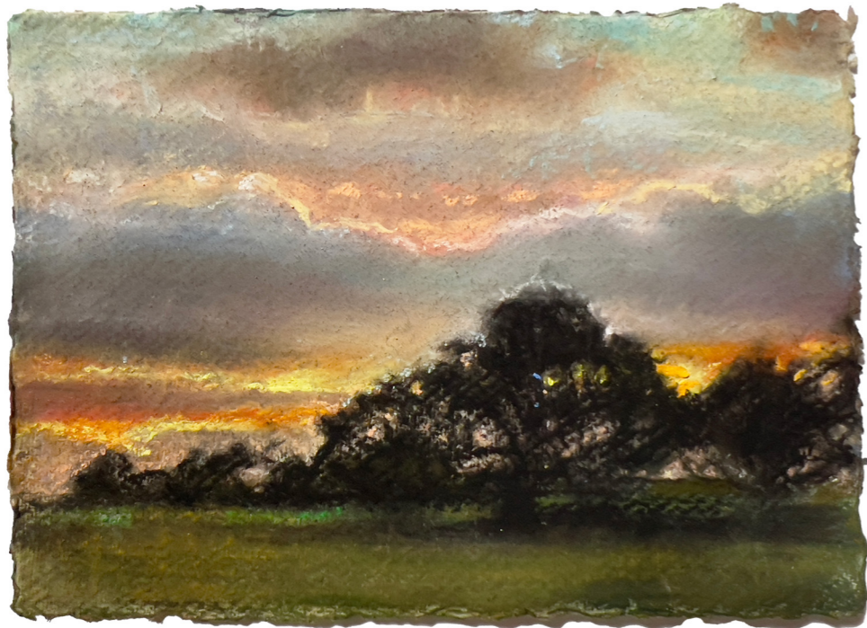
Tower Hill #3, 2024, dry pastel on rag paper, 15 x 21cm