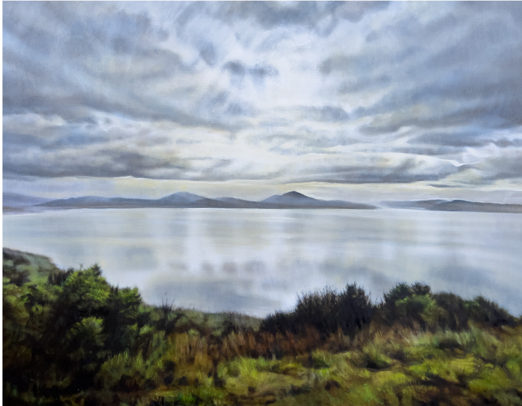
I've been here before, 2023 oil on linen 128 x 168cm