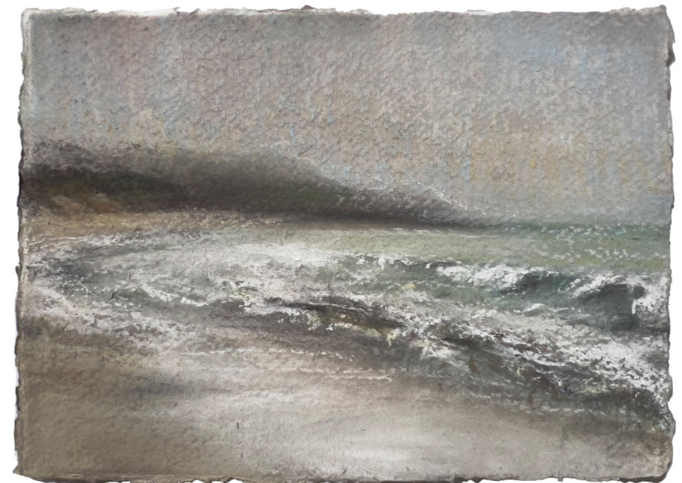
Killarney #4, 2024, dry pastel on rag paper, 15 x 21cm