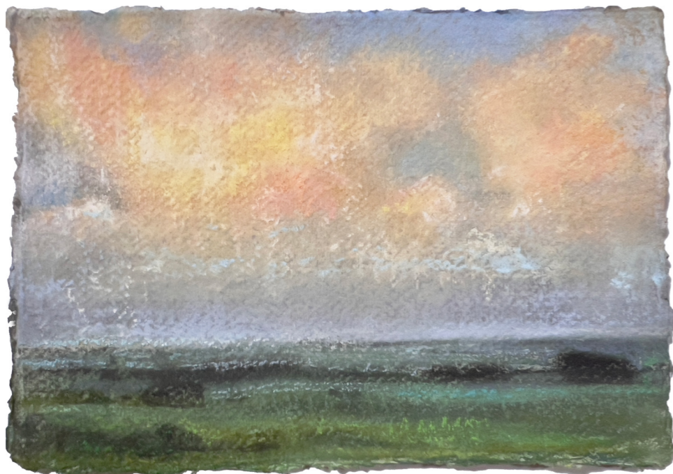
Koroit 2024, dry pastel on rag paper, 15 x 21cm