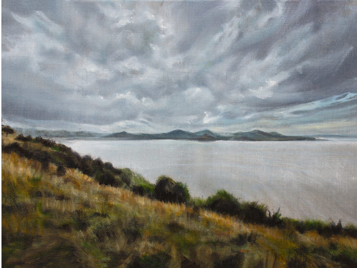
Grief I've learned, is really just love, 2023 Oil on linen 35.5 x 45.5cm