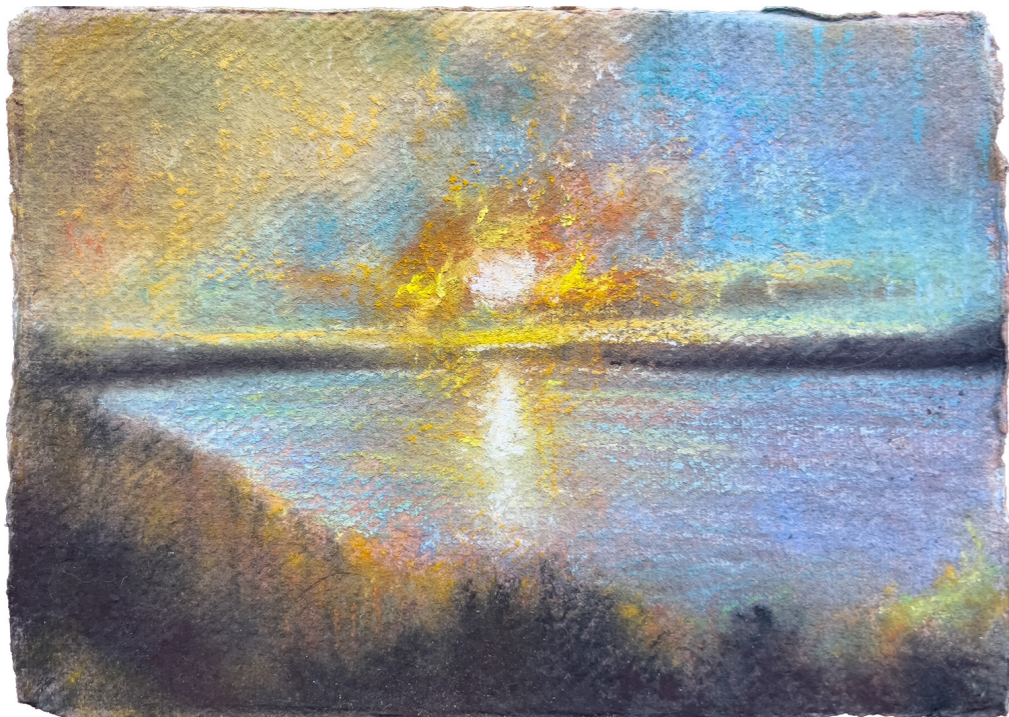
Tower Hill #4, 2024, dry pastel on rag paper, 15 x 21cm