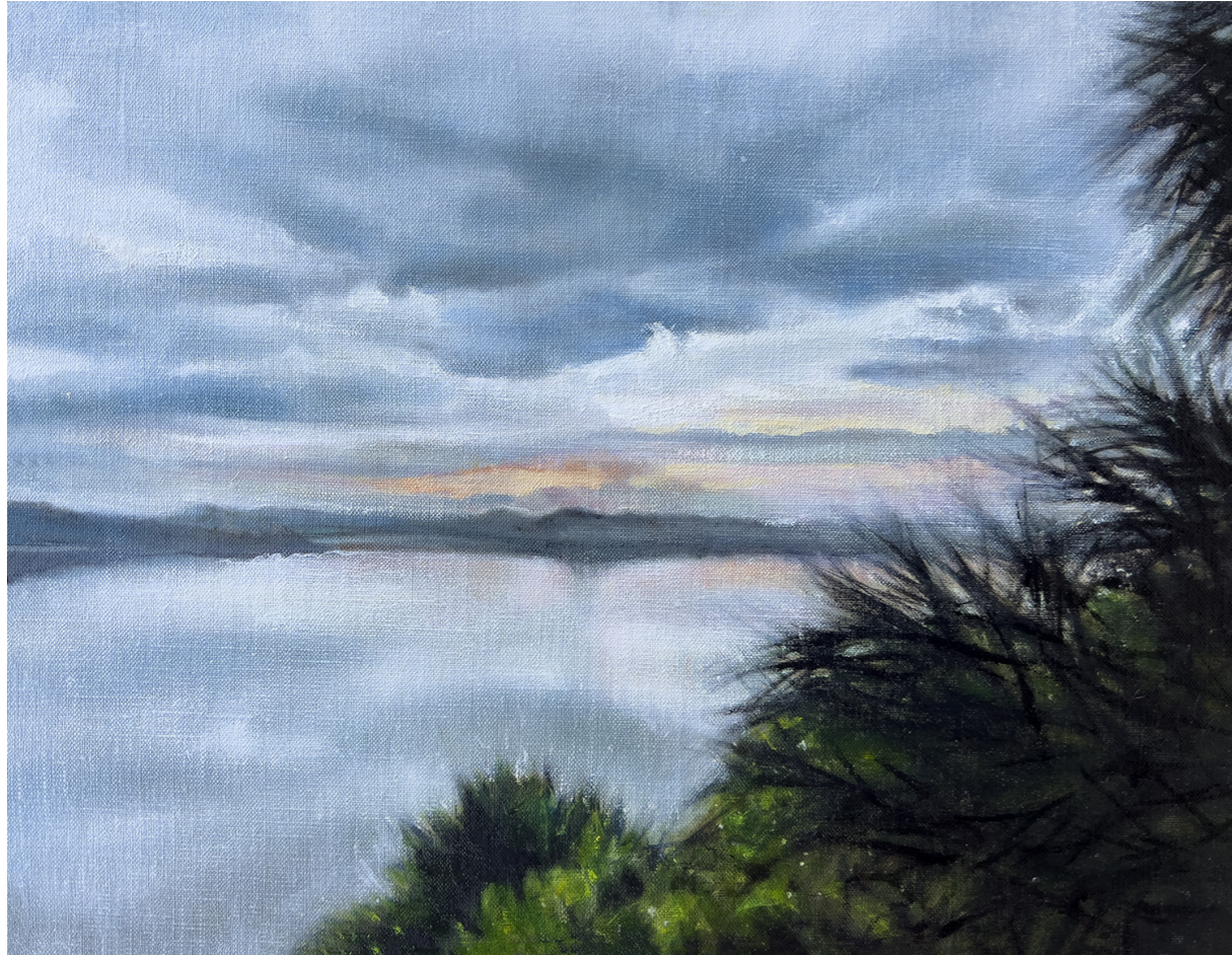
I myself must walk the path, 2023, oil on linen 35.5 x 45.5cm