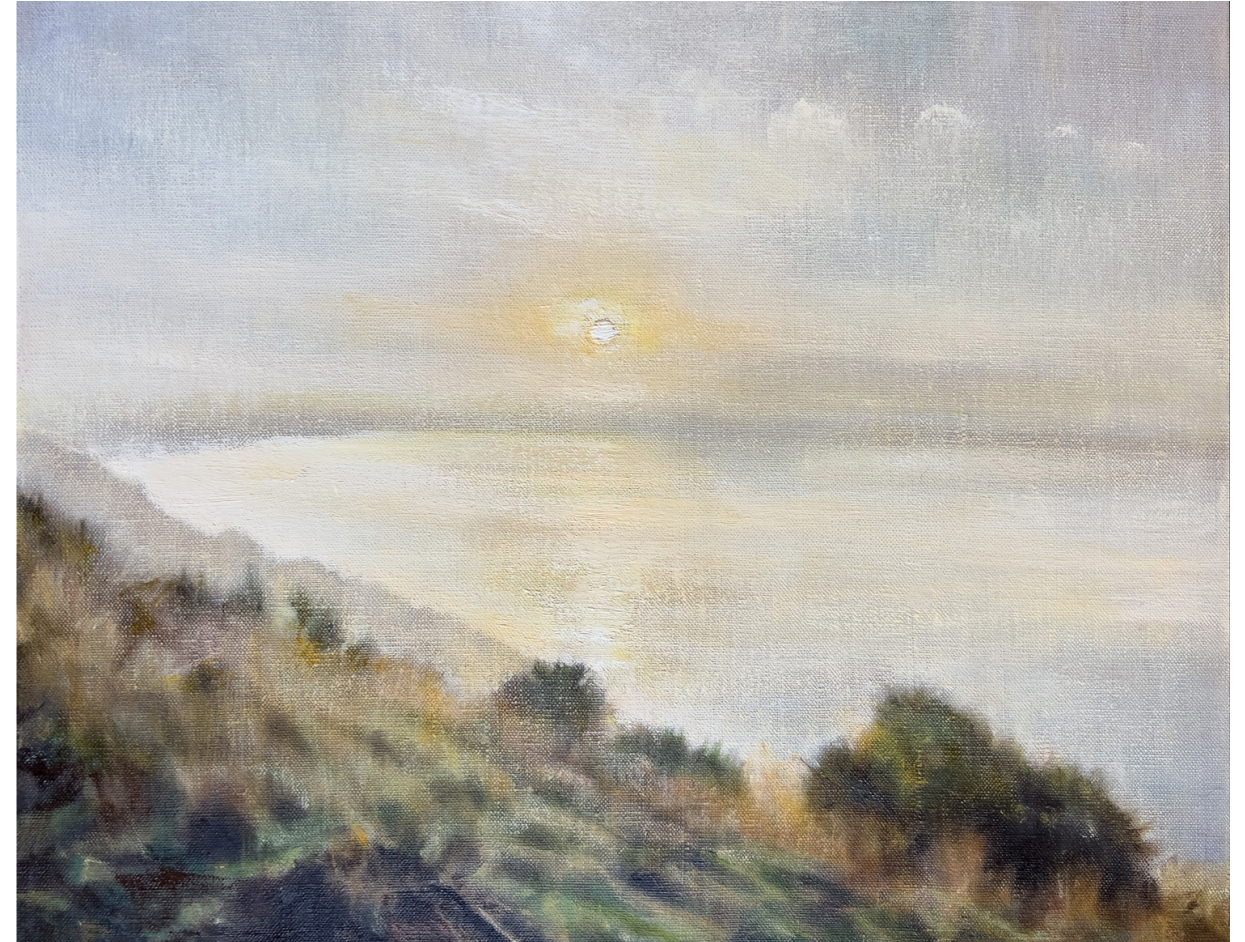
I would so quietly live among the particles of light, 2023, oil on linen 35.5 x 45.5cm