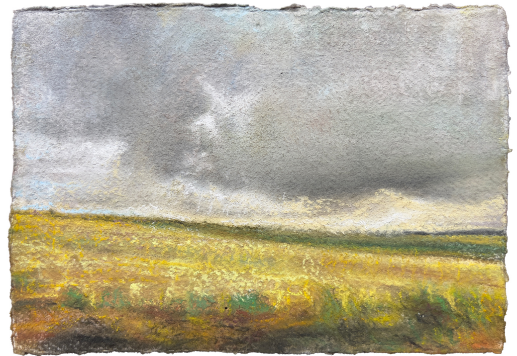
Towards Hamilton #1, 2024, dry pastel on rag paper, 15 x 21cm