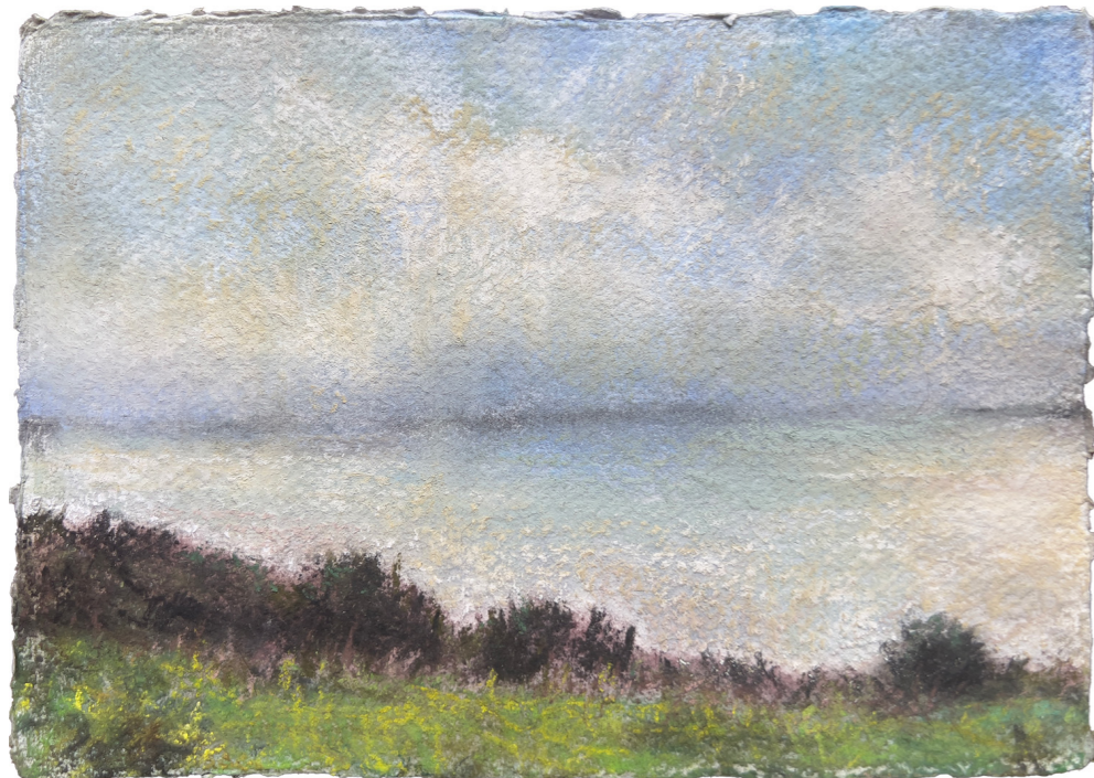
Tower Hill #1, 2024, dry pastel on rag paper, 15 x 21cm