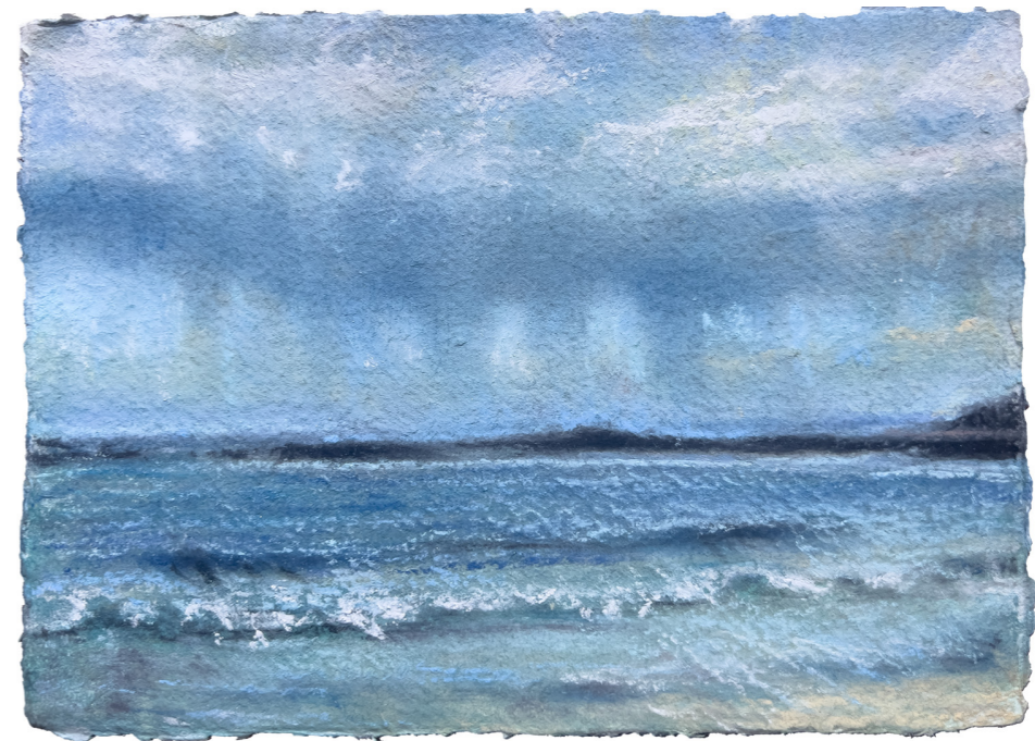
Killarney #7, 2024, dry pastel on rag paper, 15 x 21cm