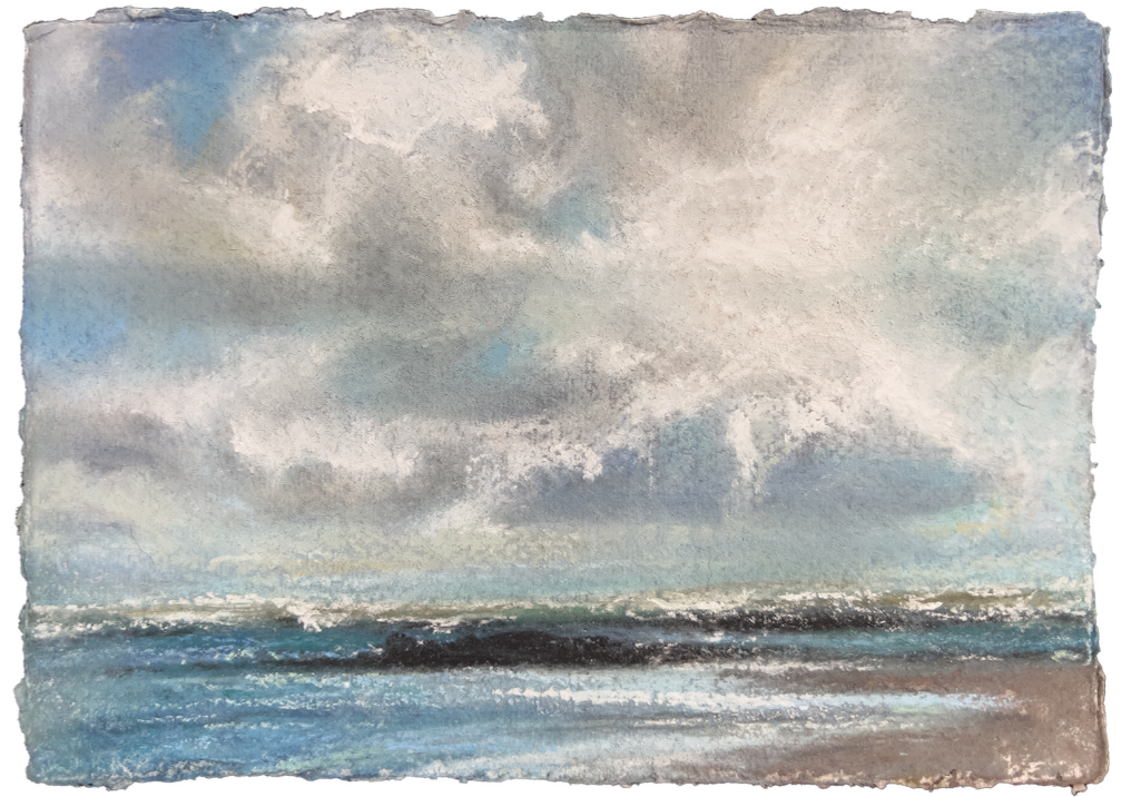
Killarney #1, 2024, dry pastel on rag paper, 15 x 21cm