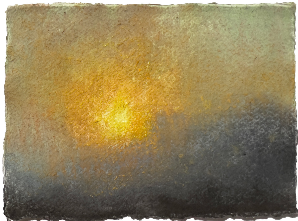
Illowa #2, 2024, dry pastel on rag paper, 15 x 21cm