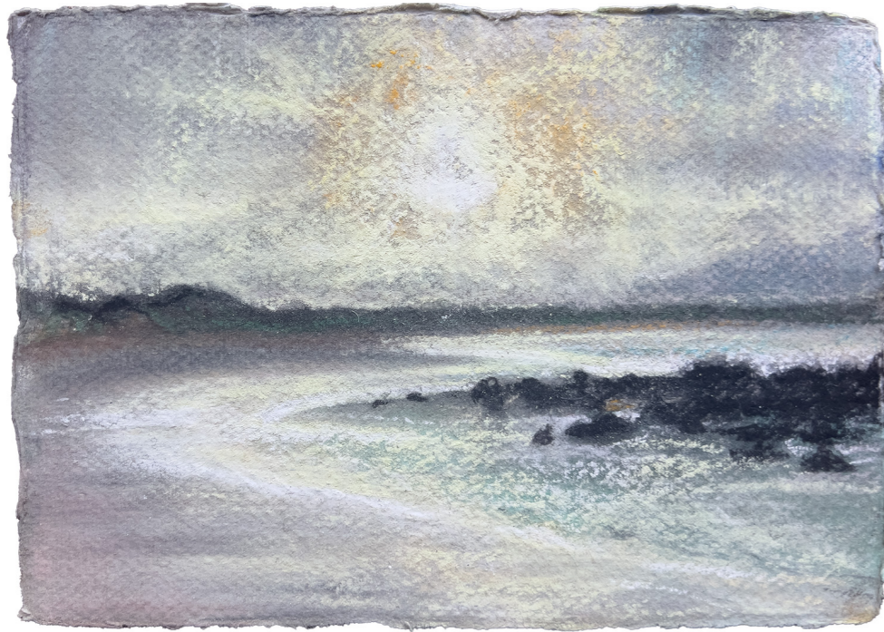
Killarney #5, 2024, dry pastel on rag paper, 15 x 21cm