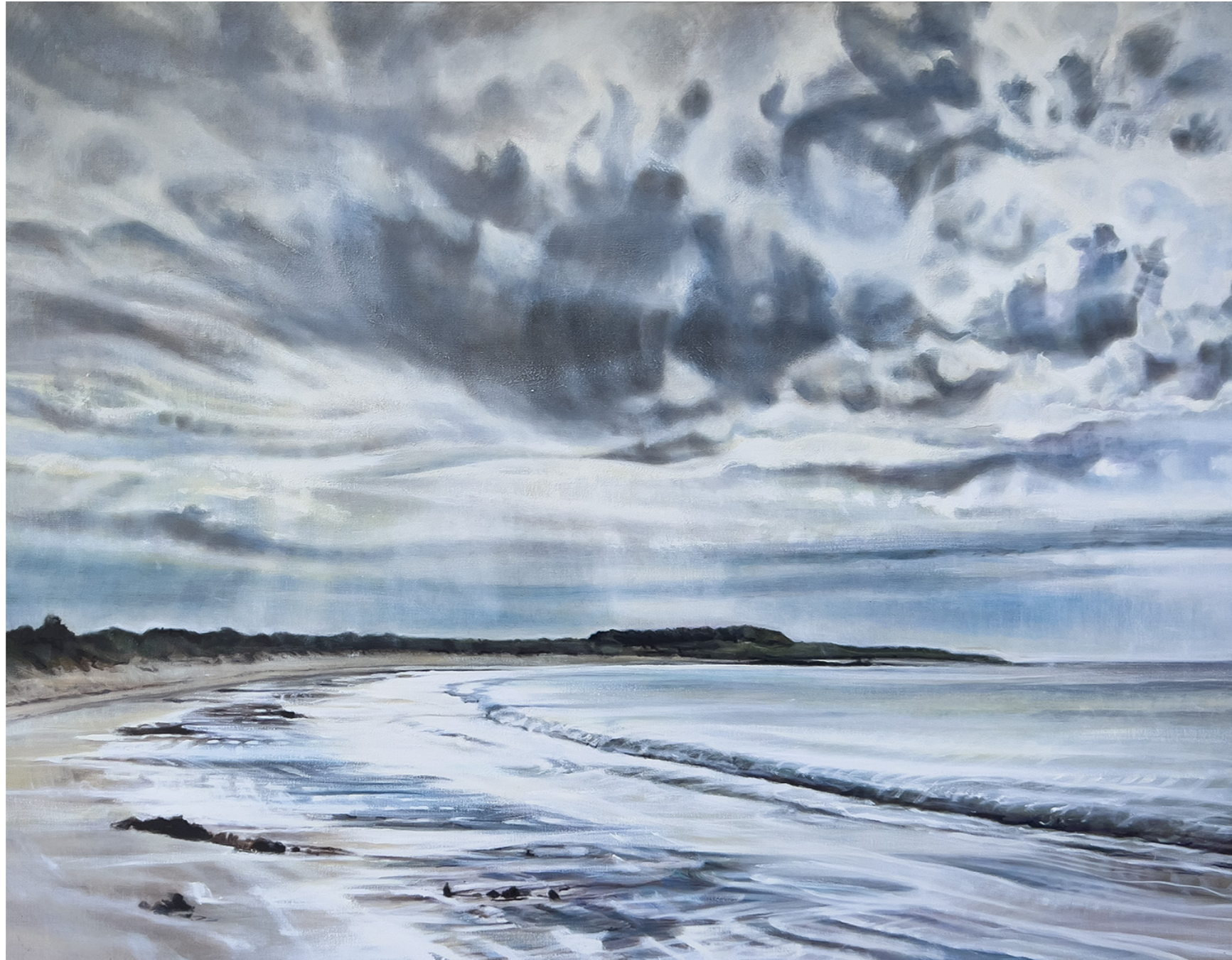
I like to feel the wind hit my skin, 2023 oil on linen 128 x 168cm