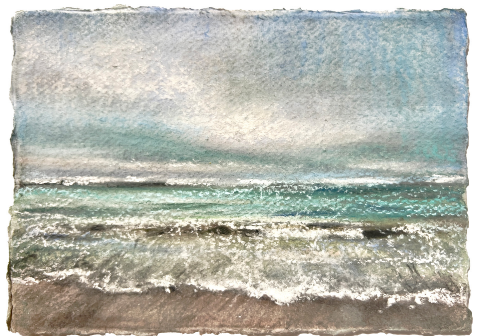
Port Fairy #1, 2024, dry pastel on rag paper, 15 x 21cm