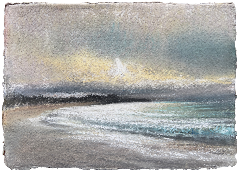
Killarney #2, 2024, dry pastel on rag paper, 15 x 21cm