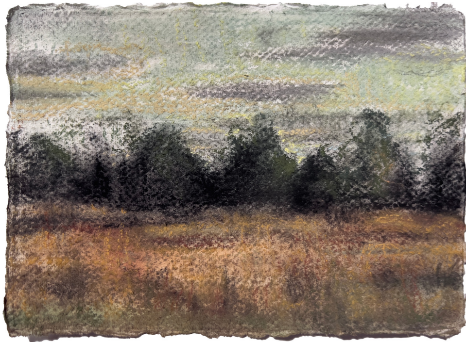
Beyond Warnambool, 2024, dry pastel on rag paper, 15 x 21cm