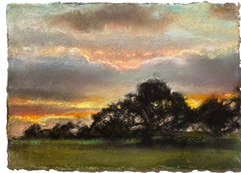
Tower Hill #3, 2024, dry pastel on rag paper, 15 x 21cm

of moisture and dust, mutable, elusive, so unlike anything I had ever painted before. I have been painting in oils for 35 years, developing a meticulous and deeply personal painting practice, but my new environment has had a profound affect on my painting practice and compelled me to develop new painting techniques evocative of texture, feel and ether. Silent Atmosphere's offers a window into the unfathomable mysteries of our gaseous atmosphere, and the patterns of its movement across this dynamic landscape".