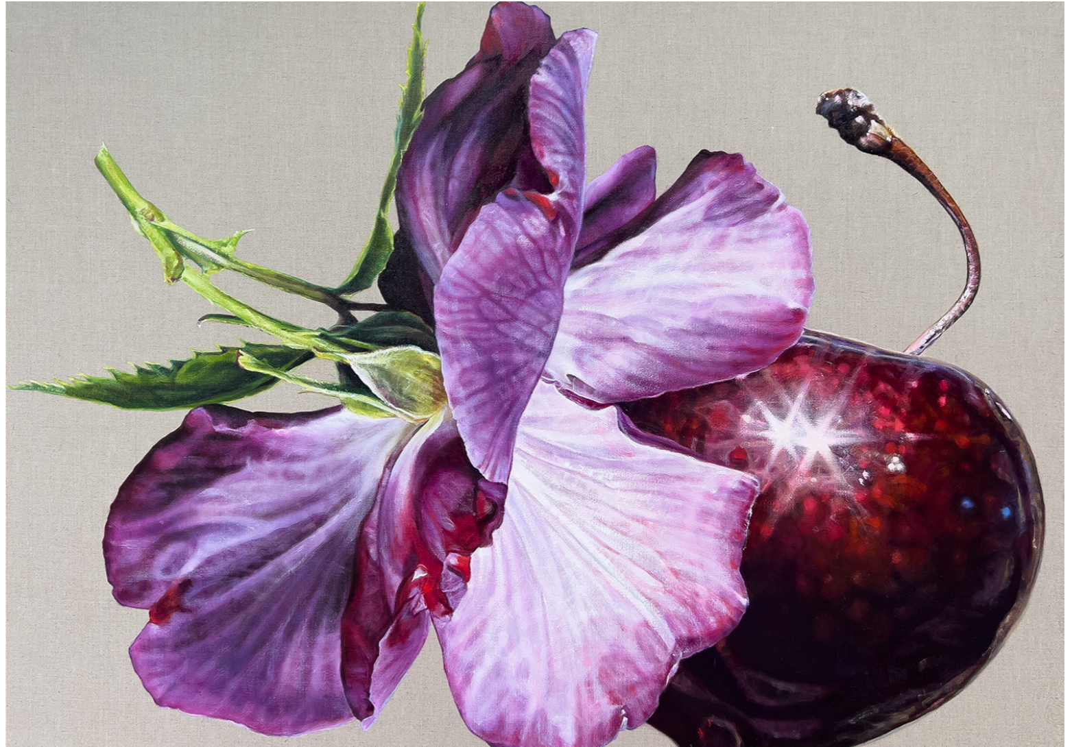
Purple rose, velvet kiss, 2023, oil on linen, 96 x 126cm

Gates of Paradise has been exhibited in London and Melbourne, and in select International Art Fairs including Art Stage Singapore and Sydney Contemporary.