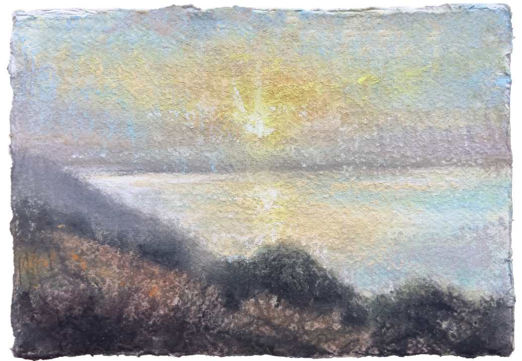
Tower Hill #6, 2024, dry pastel on rag paper, 15 x 21cm