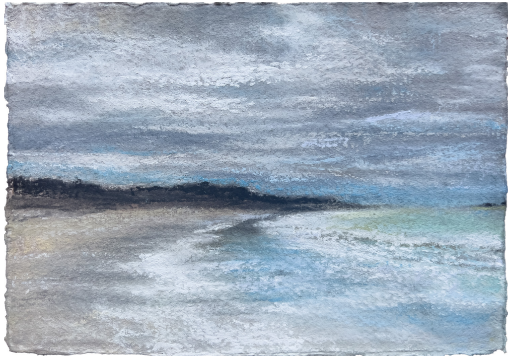
Killarney #07, 2024, dry pastel on rag paper, 15 x 21cm